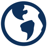
Land Use Application

The Online Permit Portal has a document that will show you the available options under each Permit Type.